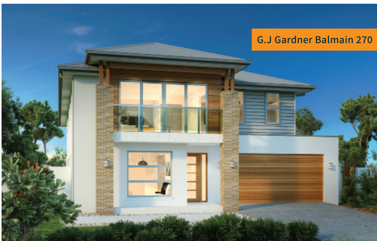
G.J Gardner Balmain 270

Please allow 10 working days minimum for the initial assessment of your submission.